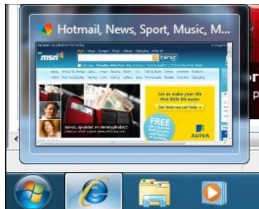
Figure 1.3 – Hover your mouse pointer over a program running on the Taskbar to see a preview of the window

If you hover your mouse pointer over a running Taskbar icon, Windows will show you a preview window:-